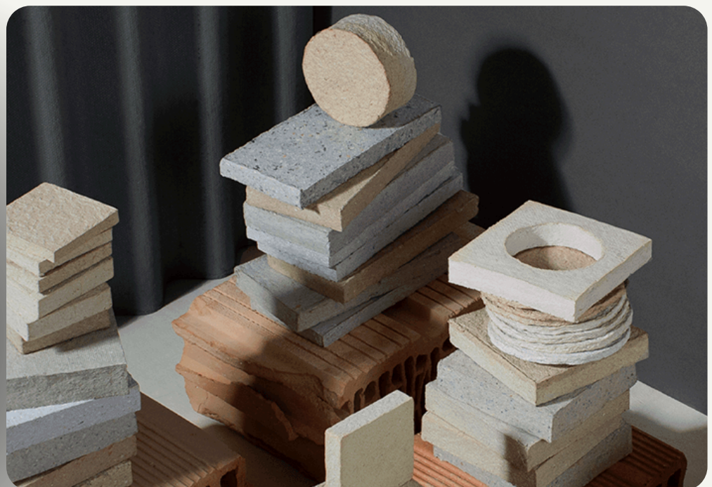
Post Paper Studio by Davide Onestini